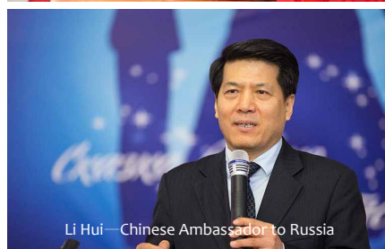
Li Hui—Chinese Ambassador to Russia

90% of top interpreters for China's Ministry of Foreign Affairs