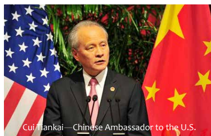
Cui Tiankai—Chinese Ambassador to the U.S.